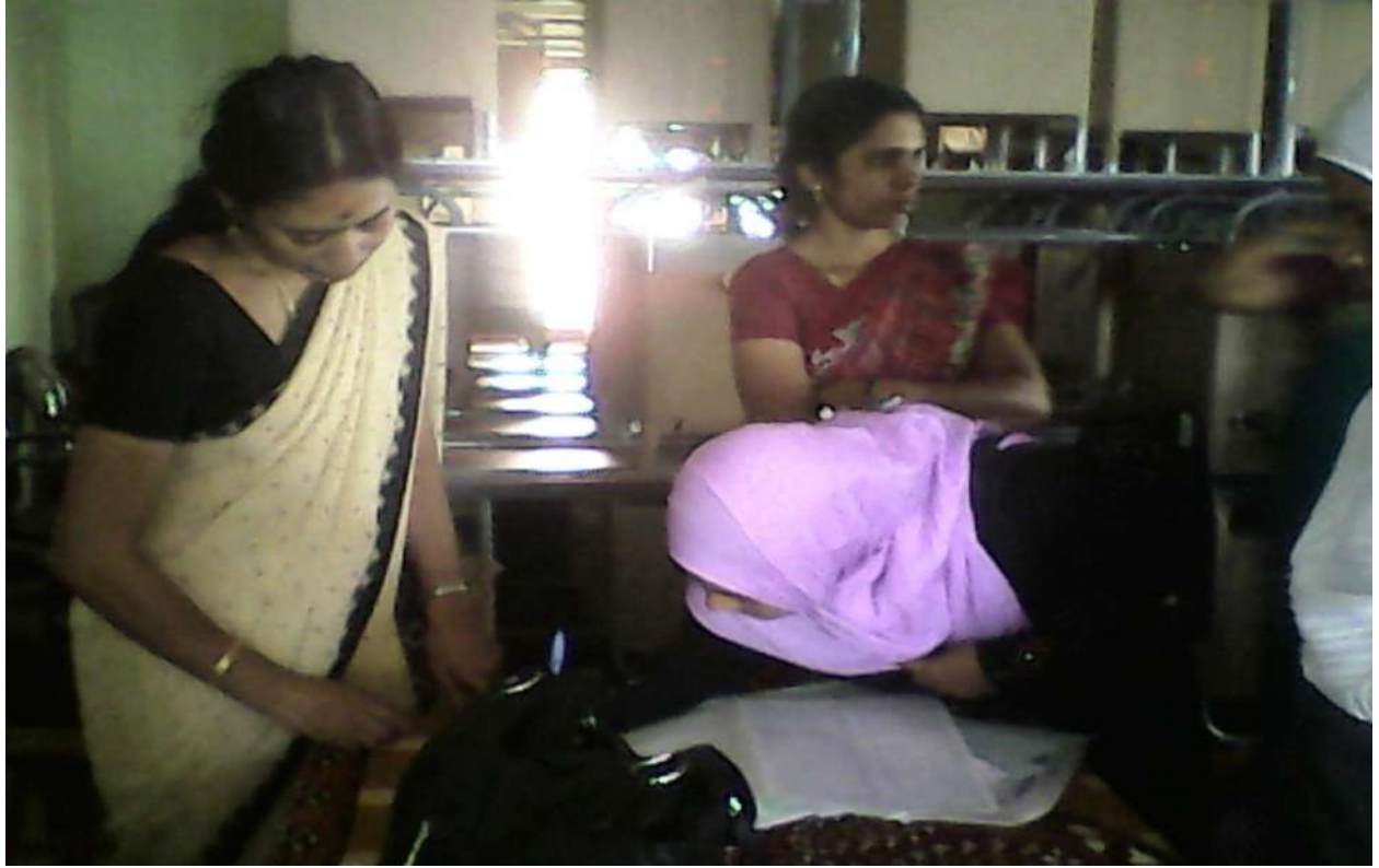
Registration by the participants