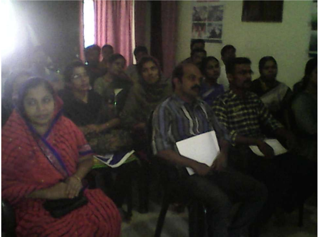
Participants of Talent Mela