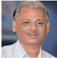
Shri. B.B. Swain, IAS Secretary Ministry of MSME Govt. of India